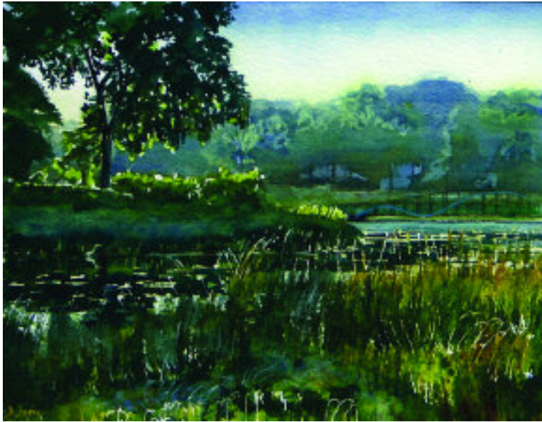
▲BEST OF SHOW “Reflecting Pool”, Jeanne Long