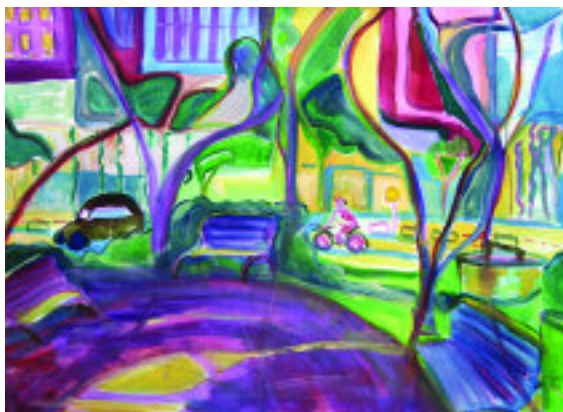
▲Honorable Mention “City Biker”, Emmy White