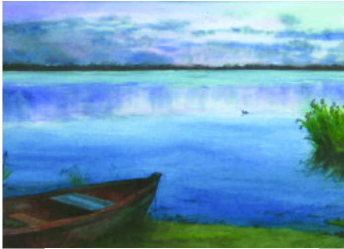
▲First Honors “Sunset on Lake”, CeCeile Hartleib