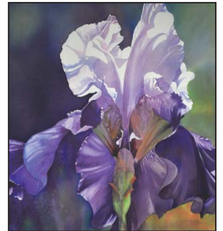
“Ruffles and Flourishes”