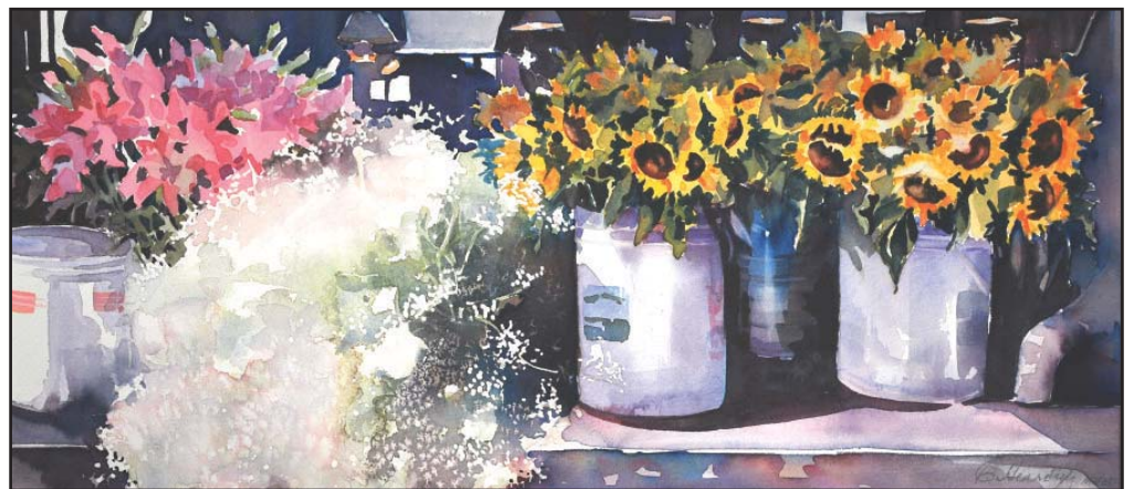
“Baby’s Breath and Sunflowers”