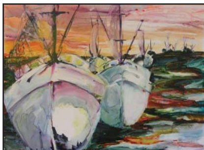
"Spills Kill!" by Bonnie Crouch