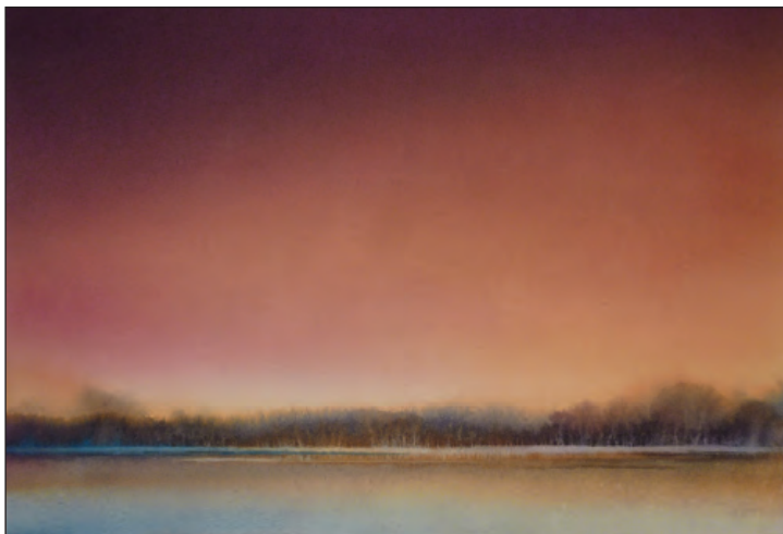
“Series 7 #1” by Nanci Yermakoff Awarded: Best of Show and People’s Choice