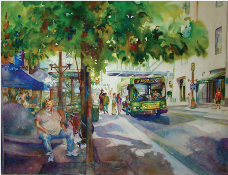
“Nicollet Mall” By Susan Zavadil

Minnesota Watercolor Society Fall Show September 30 – November 2, 2012