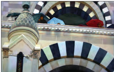
"Chapel of the Umbrellas" by Tara Sweeney