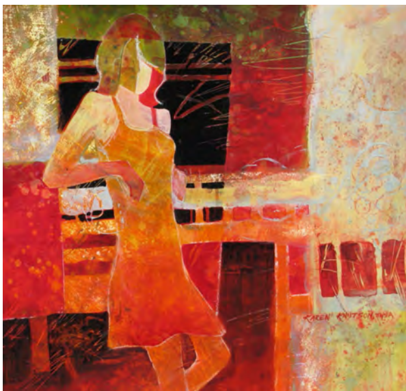
Waiting for Mr. Right