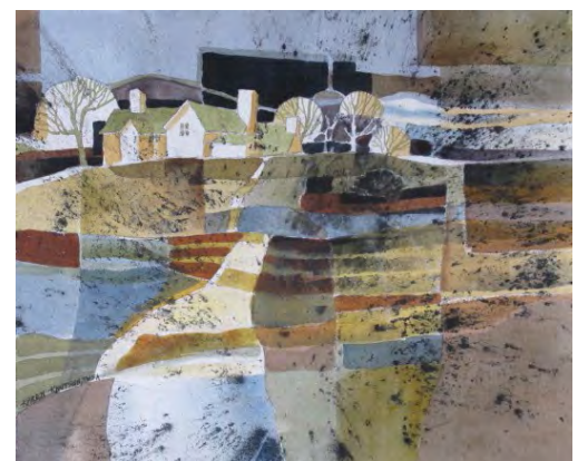
Memories of Home