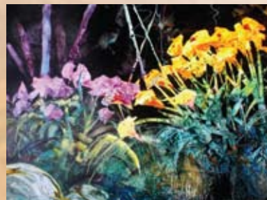
Flowers by Jim Turner

This workshop will give you a variety of ways to approach this new medium YUPO. James will show you how to take advantage of the abstract, flowing 'liquid' look of wet into wet application and experiment with texturing. This surface allows colors to be more intense, giving a stained glass look that is amazing, and makes lifting easy, allowing a push-pull method of composition. He will discuss design and how to go from the crazy accidental abstraction to finished work. He will also help you tame YUPO to do representational work with flattening washes, graded washes and more. Participants can expect to complete two paintings in the three days and just have fun.