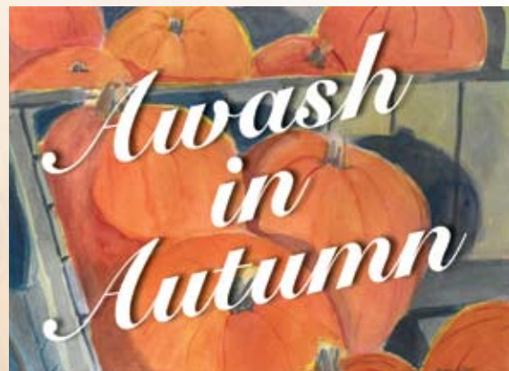
Pumpkins, by Jean Allen

Monday, Oct. 22: Pick up at gallery 10 am to 1 pm