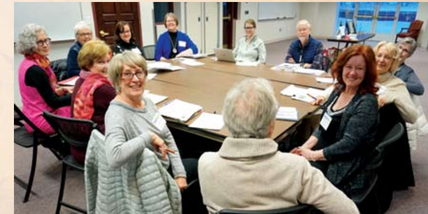
2017-18 MNWS Board Members

Volunteers do not necessarily have the time; they just have the heart.