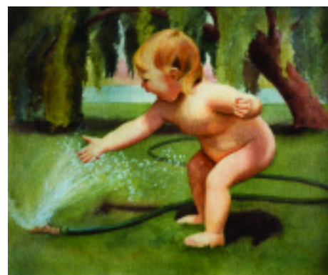
▲"Playing with the Hose" by Ceile Hartleib.

In the portrait demonstration, I will stress composition, drawing, and value as being more important than color. I build up my watercolor portraits with washes, or glazes, starting with a light pinkish tone over everything, lifting out highlights along the way, then proceeding to add layers of various colors. I find purples, blues, yellows, greens, oranges, reds and pinks and float them in where I —cont. on p.3