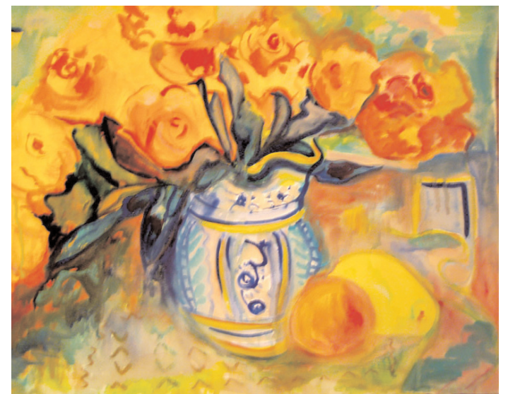
"Yellow Roses" by Emmy White