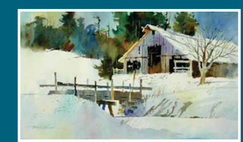
Tony Couch September 15-19, 2008