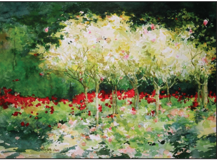
"Rose Trees and Geraniums"

By the time I got to paint in Monet's Gardens, I'd been working in watercolor for about 35 years. So how did I get to this magical place? Years ago, as a young mother, I was sitting in a doctor's office looking at a magazine, when I came upon an article about a program through the Monet Foundation that allowed students to paint for an extended period of time in Monet's Gardens in Giverny, France. In that moment my dream began.