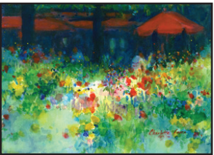
"Lunch in Paris"

When I look back at my life so far, I see touch points, things that individually would not have indicated the path I am on, but that collectively have led me to where I am today. This experience parallels the way I paint: from the inner leading of my heart.