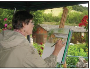
Demo on the terrace of Artstudy in Giverny

Have you ever had a dream? I believe that they are God-given and really meant to come true. This is the story of a dream come true, how a girl from a farm in Southern Minnesota came to paint in Monet's Garden in Giverny, France.