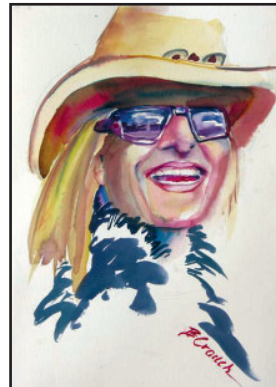
"Star" by Bonnie Crouch