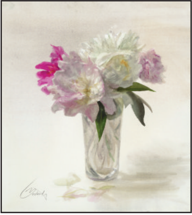
by Rick Kochenash

drawing, values, and edges. Ah, the rub ... to draw correctly and accurately the first time. To boldly and confidently declare color values and make edge comparison decisions decisively, and leave them alone! The "master's medium." Yes, but what learning opportunities watercolor provides for the pupil of nature! To have the piece itself reject completely your indecisiveness. To transparently lay out