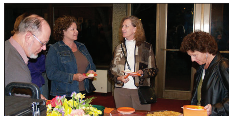
Members chat while enjoying appetizers.

Thank you to our award sponsors, Wet Paint, Indigo Art and Trade Winds, who each contributed gift certificates for our award winners.