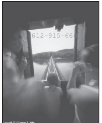
“Minnesota Receding” is a photo made with a Whitman Candy tin onto 2 ¼ x 3 ¼ sheet film and traditionally printed. The scene is looking out the back of a train.