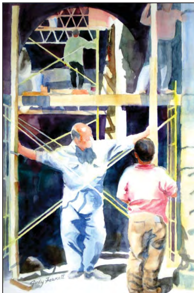
“Under Construction,” by Judy Fawcett