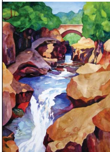
"Temperance River" by Steve Brumbaugh

Please arrange to pick up your work at the Bloomington Art Center on Saturday, November 14 between 9 - 12 a.m.