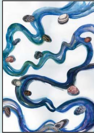
Emrich-Stordahl Founder's Award Jeanne Bourquin Light Source River