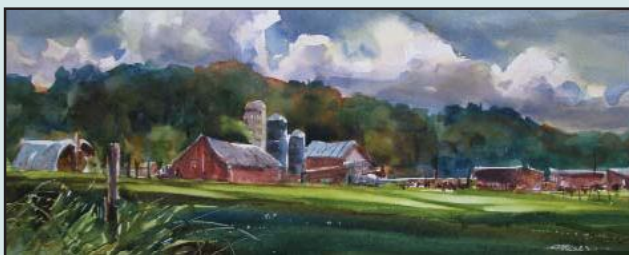
Honorable Mention Dan Wiemer Approaching Storm