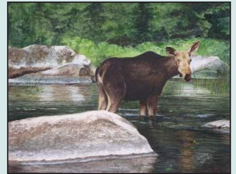
Honorable Mention Sandy Yarnes Moose