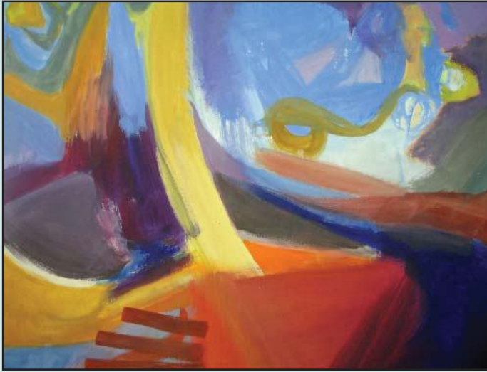
Best of Show Virginia Olson Up in the Sky So Blue