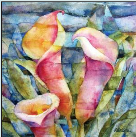
First Honor Wendy Westlake Plaited Callas