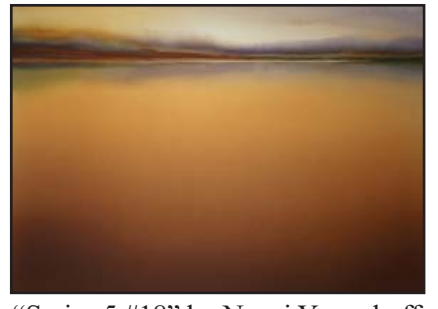
"Series 5 #18" by Nanci Yermakoff

▶ Blaine High School is looking to purchase used Art Flats. Full or partial sets. Call Pat Undis, 763-712-1728