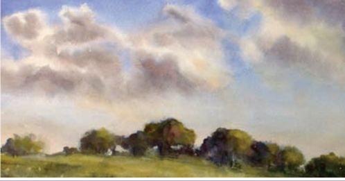
"Trees on the Hill," 14 x 11