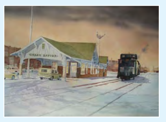
Honorable Mention Dick Green Cold Stop