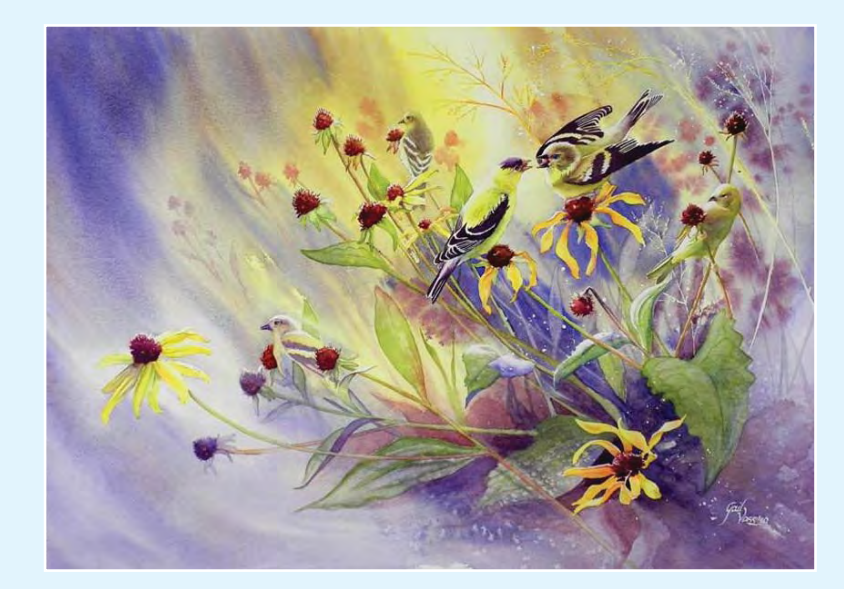
Best of Show Gail Vass Finches to the Feast