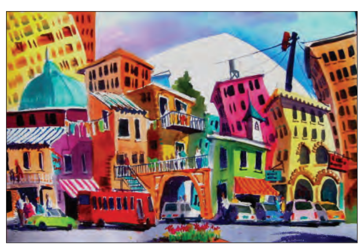
"The Pueblo, New Mexico"

without looking at a subject matter, rather figments of the mind, with freedom to create. Citiscapes are a common theme. However, all subject matter is fair game.