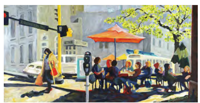
"Vanitas on East Hennepin"