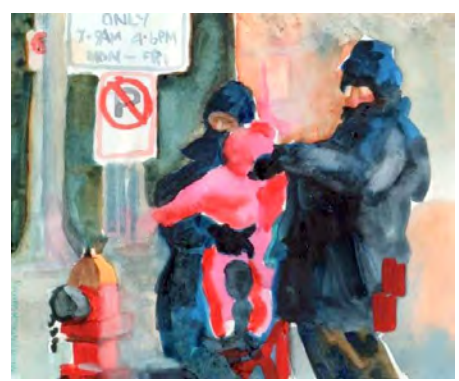
"Family at Bus Stop"

With an emphasis on design and expressive color, her watercolor, oil, acrylic, collage and mixed media paintings give visual form to the vitality and energy of contemporary urban life.