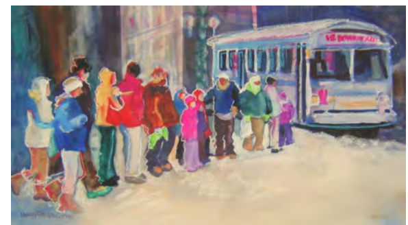
"Winter Bus Stop"