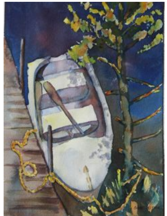
"Rowboat" by Clare Ritter