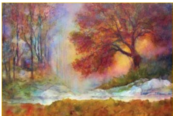
Landscape by Wendy Westlake