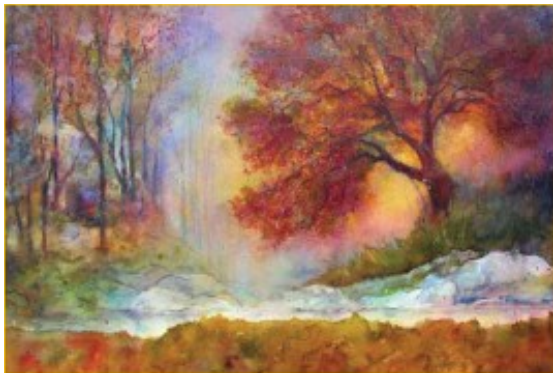
Landscape by Wendy Westlake