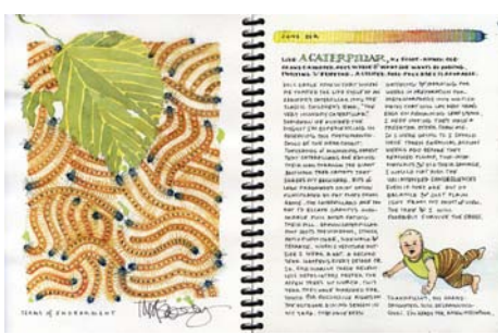
Terms of Endearment