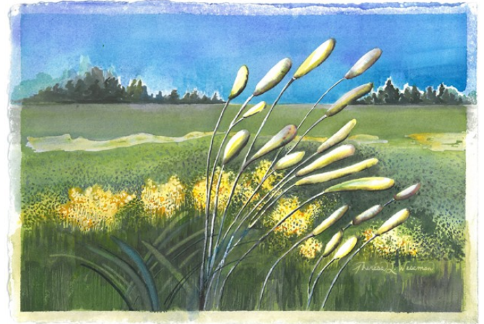
Blowing in the Wind by Therésa Weseman Honorable Mention, 2013 MNWS Spring Exhibition