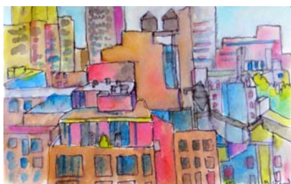
Beverly Wood - Skyline

Perfect spring weather arrived just in time for 17 participants to spend a weekend plein air sketching in watercolor and ink with Tara Sweeney for a two-day MN Watercolor Society workshop May 17-18. Our materials didn't look like a typical travel set: Tombow watercolor markers, paper palettes, and Niji water brushes were new territory for most of us but we liked the portability.