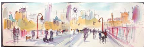
◀ Diane Monroe Stone Arch Bridge

After lunch, windows from the Guthrie's upper floors provided panoramic vistas for sketching the mighty Mississippi before we headed out across the Stone Arch Bridge. It's a delight to discover the variety of subject matter visible from this historic bridge: mills ruins coexist with a striking downtown skyline; diners, strollers, dog walkers, newlyweds, bicyclists and tourists on Segways share the pedestrian-only span across St. Anthony Falls.