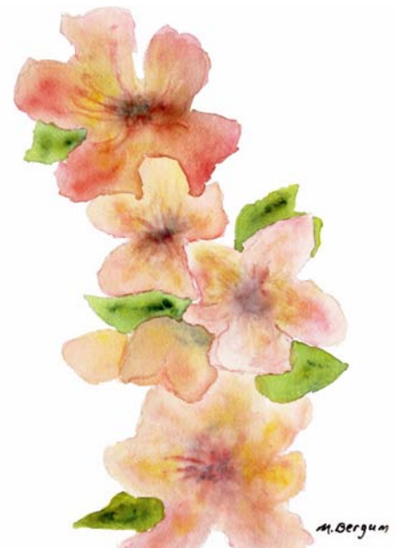
Molly Bergum Apple Blossoms