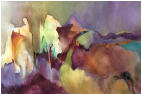
Bonnie Crouch Neo Boreal Nomads