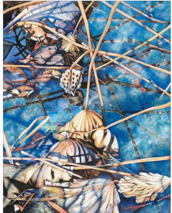
VAJRA VISION | KRISTINE FRETHEIM Best of Show, 2014 MNWS Spring Exhibition