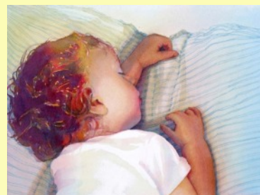
Tara Sweeney's portrait approach

Tara Sweeney demonstrates her signature approach to portraits—a three-layer/four value/hold-the-whites approach that results in lively brushwork and vibrant color with a split primary palette.