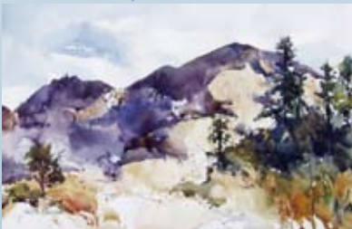
Majestic Mt. Diablo