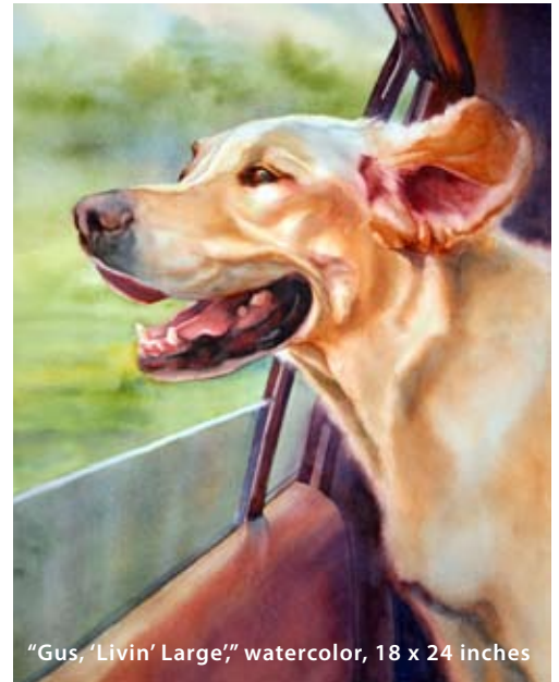
"Gus, 'Livin' Large," watercolor, 18 x 24 inches