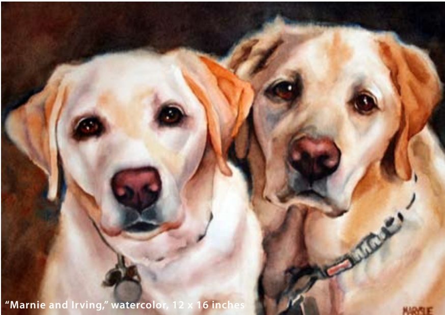
"Marnie and Irving," watercolor, 12 x 16 inches