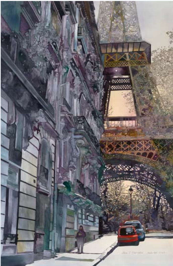
Carrousel de Paris

The Minnesota Watercolor Society and Minnetonka Center for the Arts are co-hosting this event.