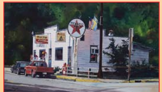
Short Stop Cafe, by Fred Dingler