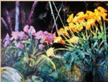
Flowers by Jim Turner

This workshop will give you a variety of ways to approach this new medium YUPO. James will show you how to take advantage of the abstract, flowing 'liquid' look of wet into wet application and experiment with texturing. This surface allows colors to be more intense, giving a stained glass look that is amazing, and makes lifting easy, allowing a push-pull method of composition. He will discuss design and how to go from the crazy accidental abstraction to finished work. He will also help you tame YUPO to do representational work with flattening washes, graded washes and more. Participants can expect to complete two paintings in the three days and just have fun.