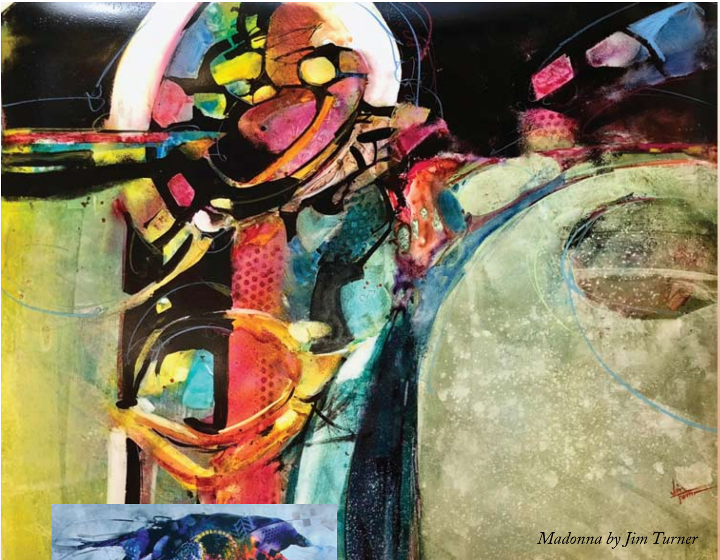
Madonna