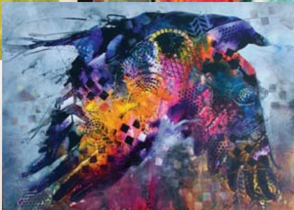
Raven