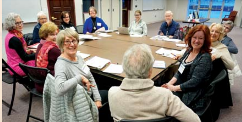
2017-18 MNWS Board Members

Volunteers do not necessarily have the time; they just have the heart.