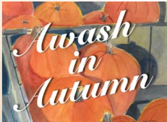
Pumpkins, by Jean Allen

Monday, Oct. 22: Pick up at gallery 10 am to 1 pm