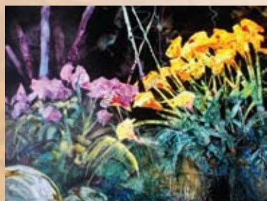
Flowers by Jim Turner

This workshop will give you a variety of ways to approach this new medium YUPO. James will show you how to take advantage of the abstract, flowing 'liquid' look of wet into wet application and experiment with texturing. This surface allows colors to be more intense, giving a stained glass look that is amazing, and makes lifting easy, allowing a push-pull method of composition. He will discuss design and how to go from the crazy accidental abstraction to finished work. He will also help you tame YUPO to do representational work with flattening washes, graded washes and more. Participants can expect to complete two paintings in the three days and just have fun.