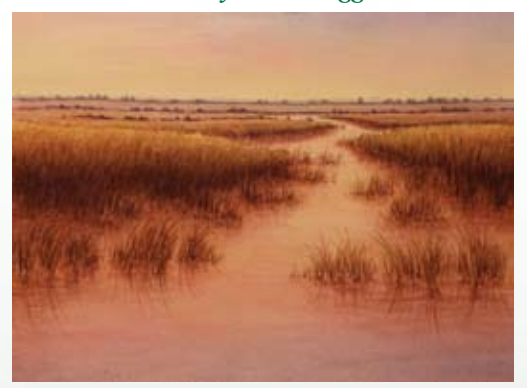
2. "Uncharted Course" by Kaye Freiberg