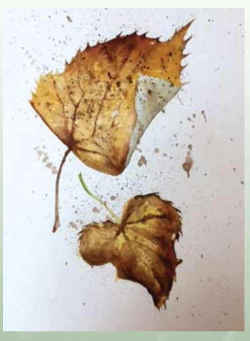
"Autumn Gold" by Vera Kovacovic

So, synchronicity, such as picking a book about flowers instead of landscapes initiated a new process. As artists, we benefit from honing the capacity to discern what "speaks" to us, becoming aware of what carries energy when choosing what to paint and allowing ourselves to be vulnerable by getting out of our comfort zone.